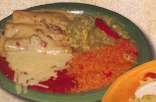
Enchiladas al Carbon