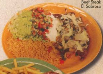
Beef Steak El Sabroso

a ribeye steak covered in shrimp accompanied with a baked potato, rice, guacamole salad and your choice of three flour or corn tortillas