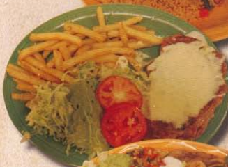
Beef Steak Jalisco